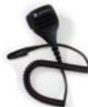
PMMN4023 Remote Speaker Microphone IP57-Rated (Mic Head only)